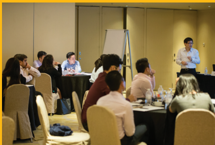
GIA Internship Programme 2017